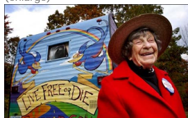
Run, Granny, Run